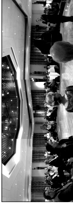
Annual Dinner and Cabaret