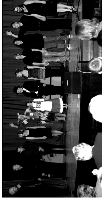
Tribute Show i.m. Ron Gilbert and John Williams